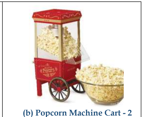
(b) Popcorn Machine Cart - 2

*All pictures shown are for illustration purpose only. Actual product may vary due to product enhancement.