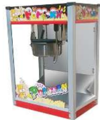
(b) Popcorn Machine Exclusive- 2

*All pictures shown are for illustration purpose only. Actual product may vary due to product enhancement.