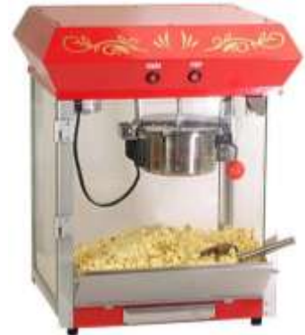
(b) Popcorn Machine Standard - 2

*All pictures shown are for illustration purpose only. Actual product may vary due to product enhancement.