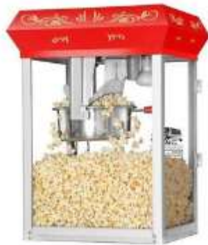
(a) Popcorn Machine Standard- 1