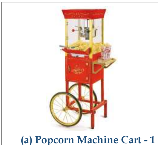
(a) Popcorn Machine Cart - 1