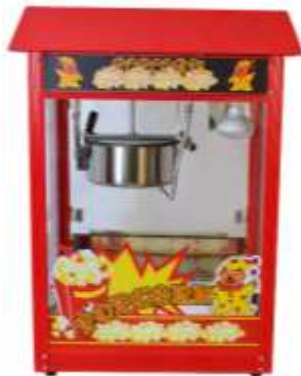
(a) Popcorn Machine Exclusive- 1