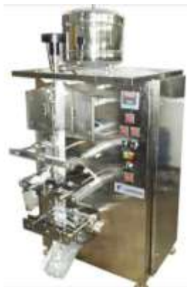
(a) Water Pouching Machine