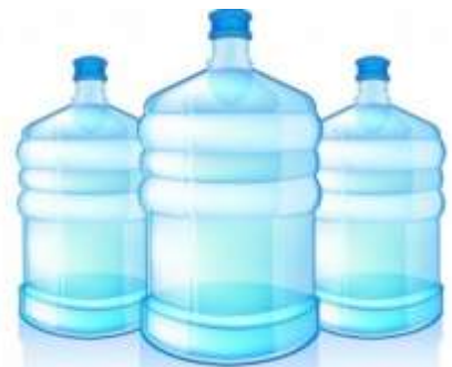
(b) 20 Ltr. Zar

*All pictures shown are for illustration purpose only. Actual product may vary due to product enhancement.