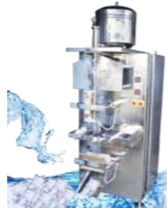
(b) 250ml. pouch

*All pictures shown are for illustration purpose only. Actual product may vary due to product enhancement.