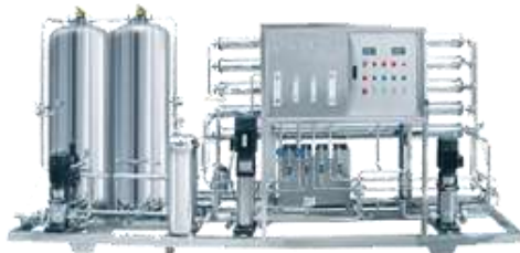
(a) ISI Bottling Plant